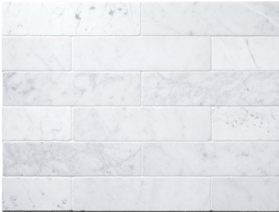
ALOS Leale Soothed 3 x 12