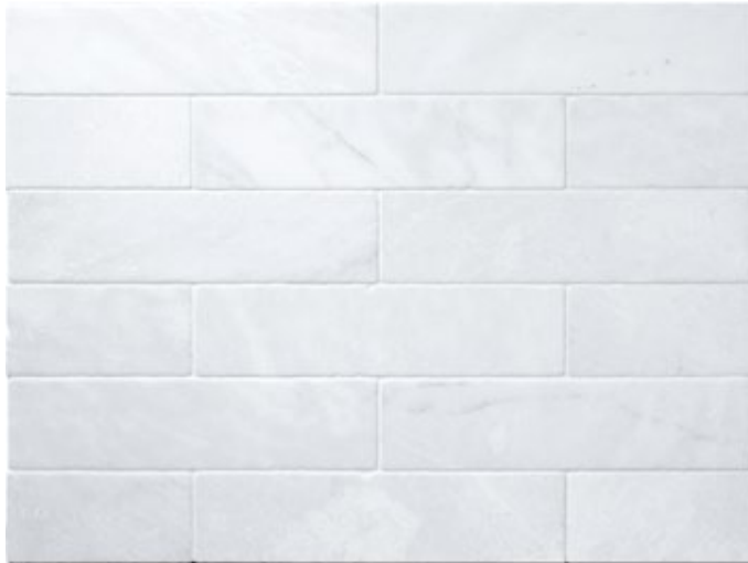
ALOS Apollonia Soothed 3 x 12