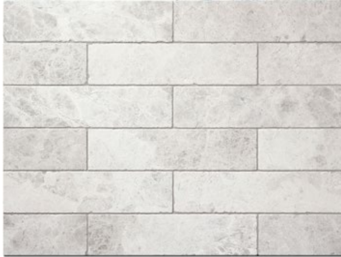
ALOS Aperlae Soothed 3 x 12