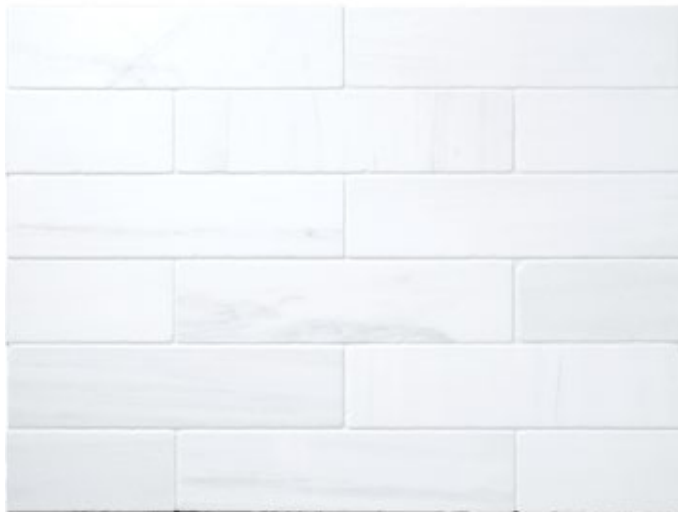
ALOS Cortese Soothed 3 x 12