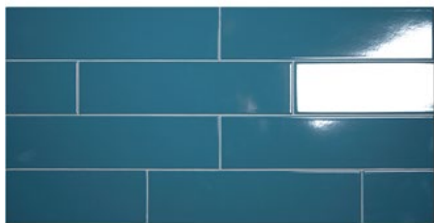
Cromia 12 Turchese