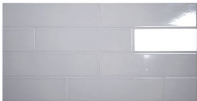
Cromia 04 Light Grey