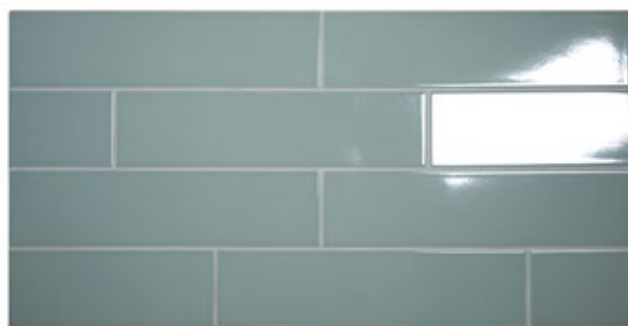
Cromia 11 Salvia