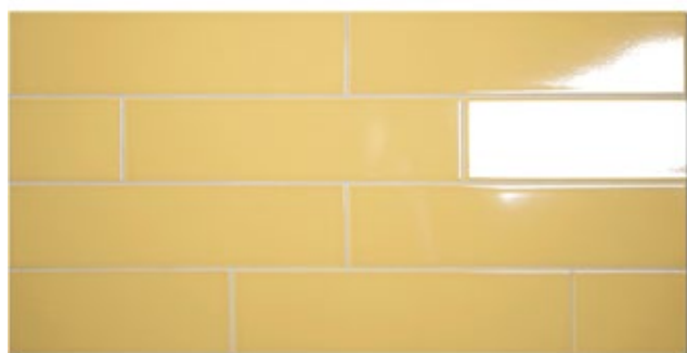
Cromia 10 Oro