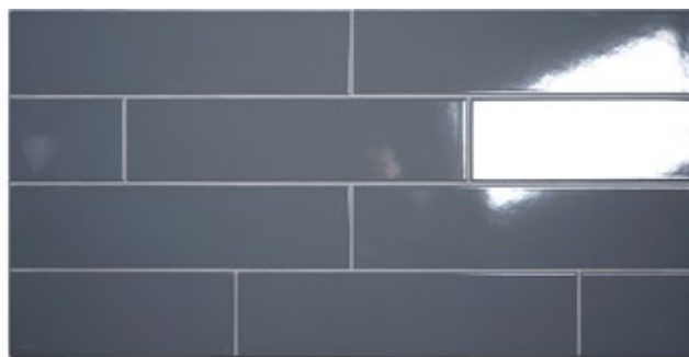
Cromia 03 Dark Grey