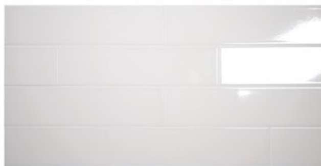
Cromia 05 Sabbia