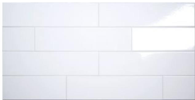
Cromia 02 Bianco