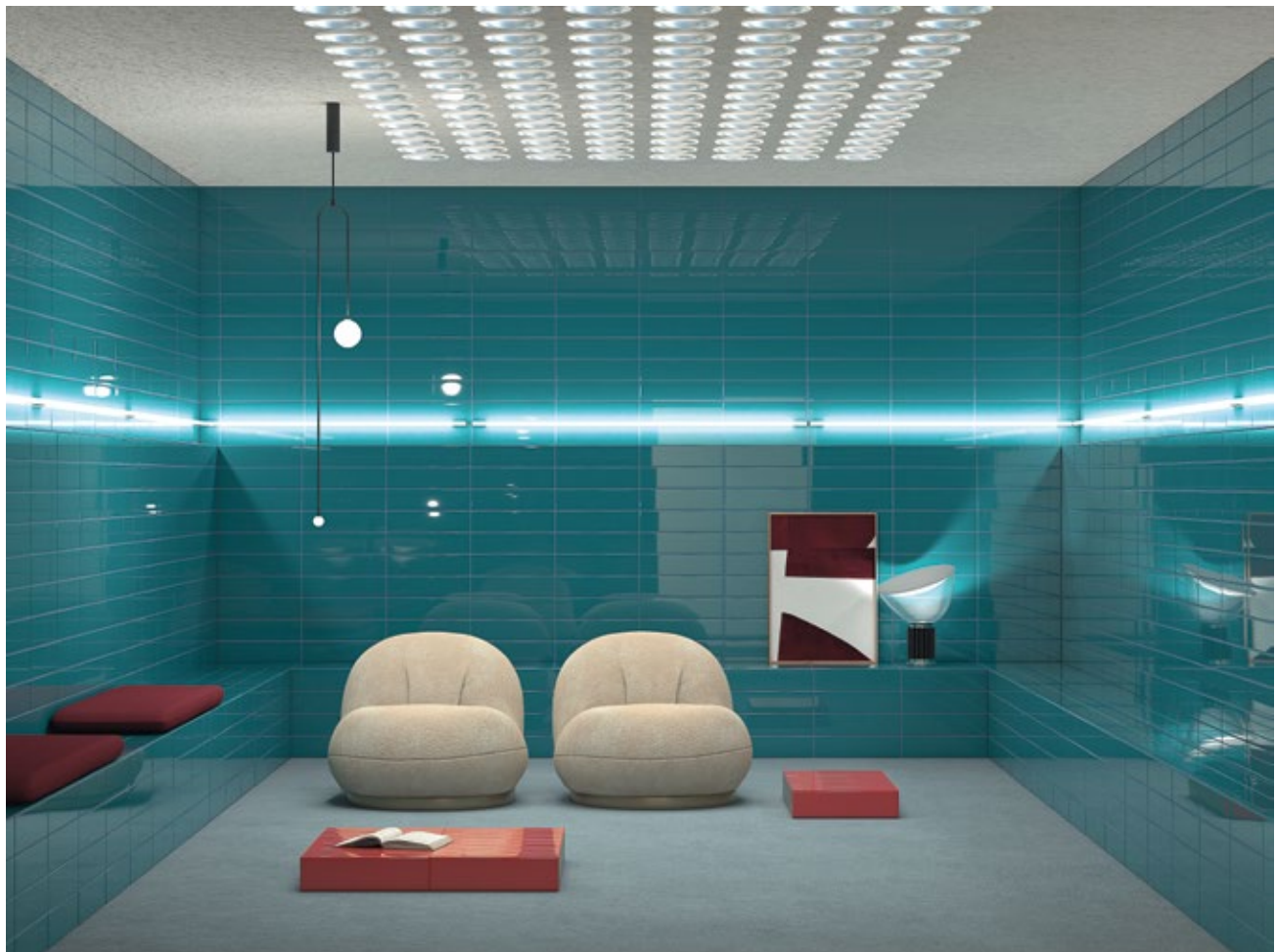
Cromia 12 Turchese