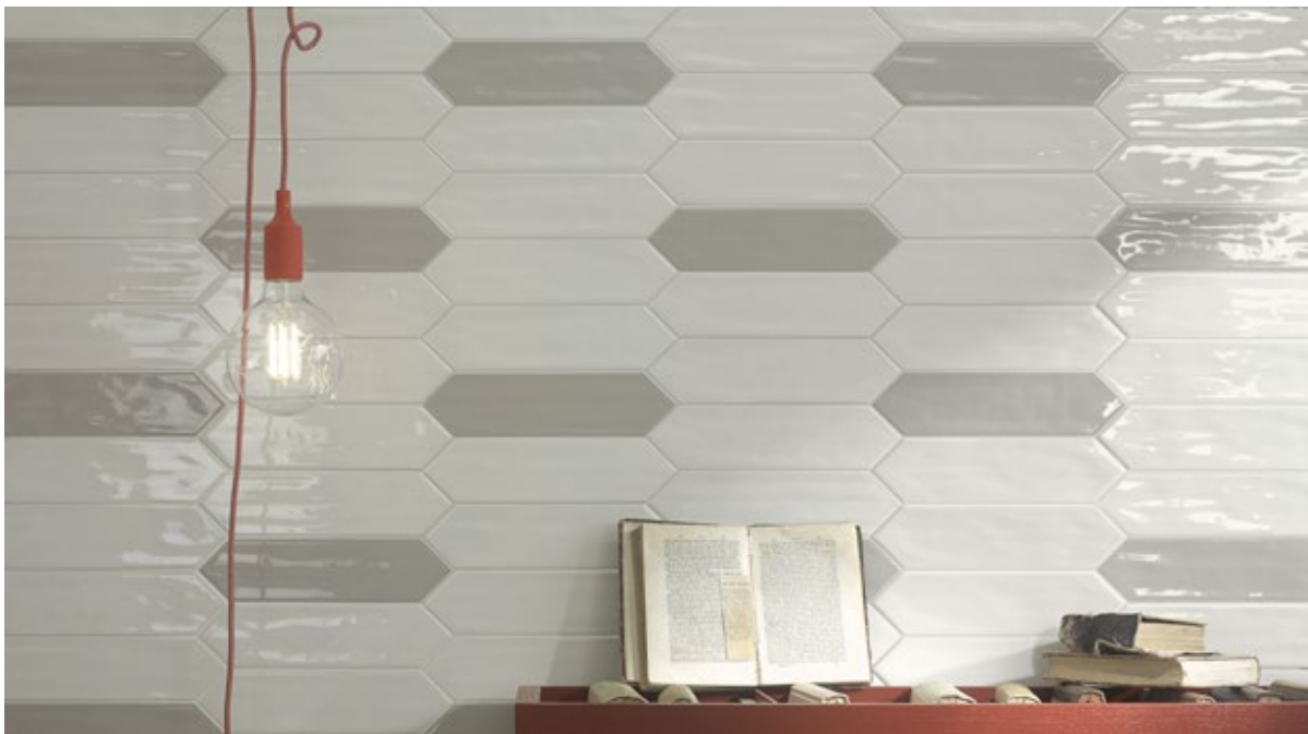
Dart Bone and Dart Greige