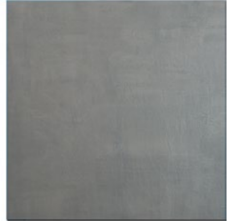
Factory Black 24 x 24