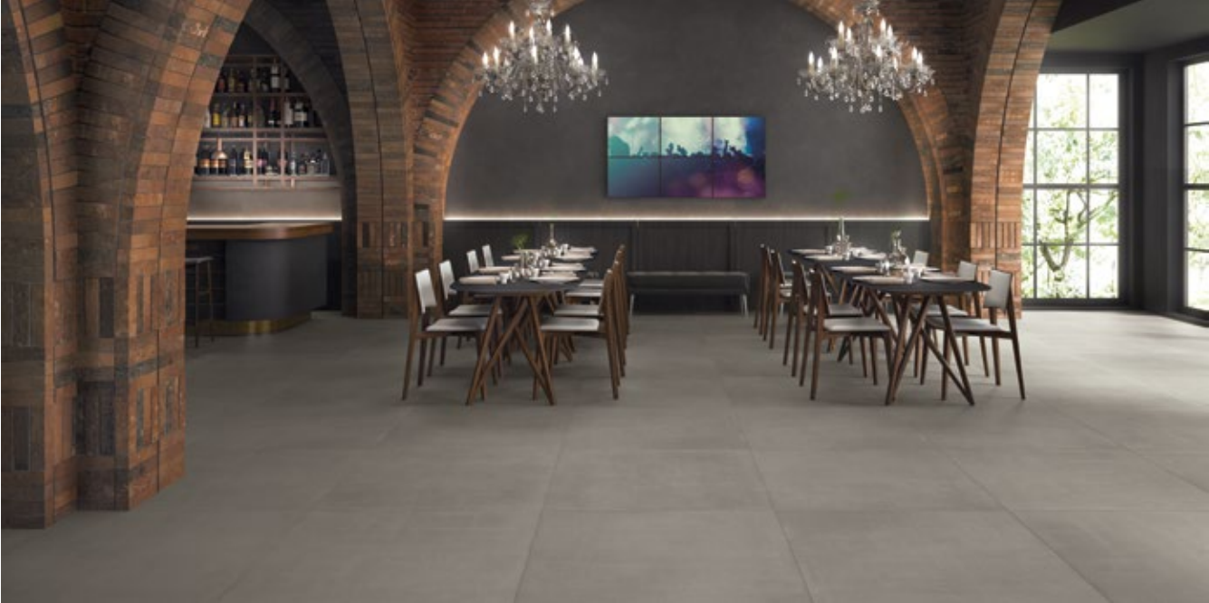
Factory Smoke 40 x 40 (special order size)