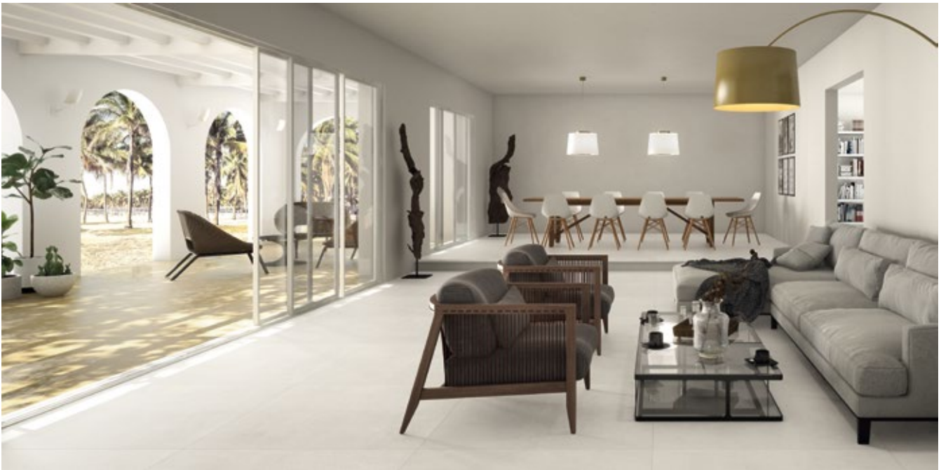
Factory White 40 x 40 (special order size)

Colors and Aesthetical features in this catalogue are to be regarded as indications. Please refer to physical samples for clarification.