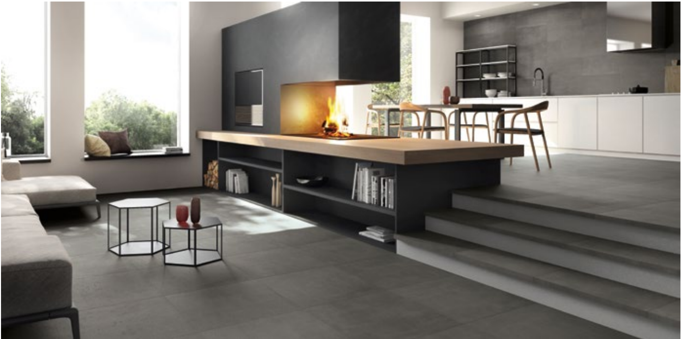
Factory Black 24 x 24 and Factory Black 12 x 24