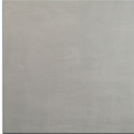
Factory Smoke 24 x 24