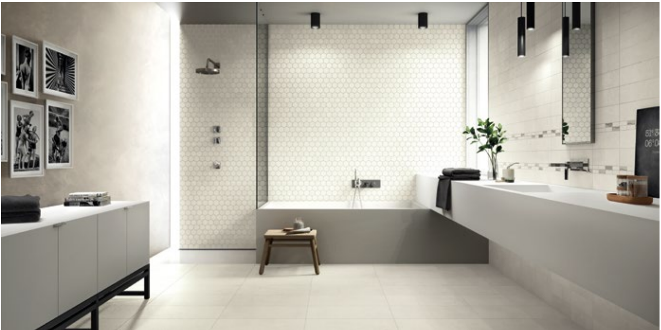
Factory White 12 x 24 Factory White Hexagon w/special order items