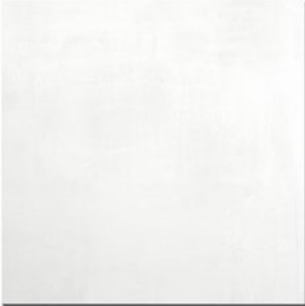
Factory White 24 x 24