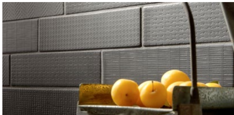
Geomatt Lavagna Slab Texture

Slab Texture is packed in RANDOM sets of FIVE! Individual patterns can not be selected out.