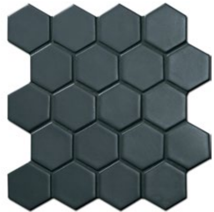
Geomatt Lavagna Hex

3 x 12 Slab Texture Mixed thickness 8.0 mm