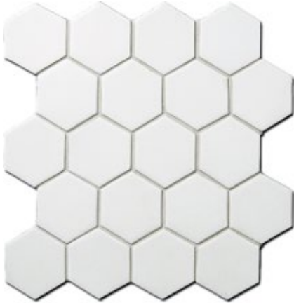
Geomatt Talco Hex