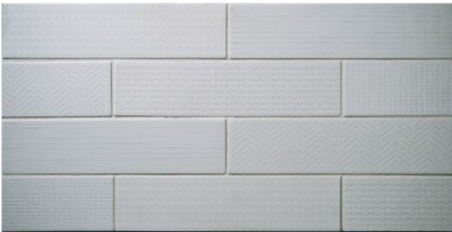
Geomatt Pomice Slab Texture