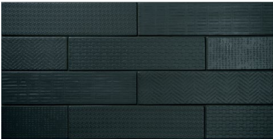
Geomatt Lavagna Slab Texture