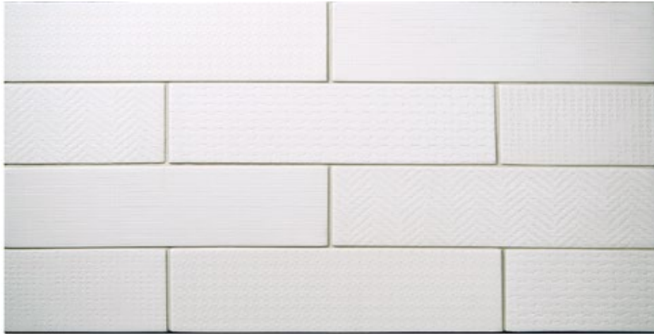
Geomatt Talco Slab Texture