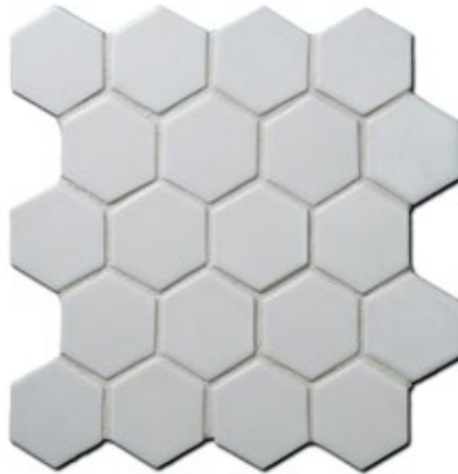
Geomatt Pomice Hex