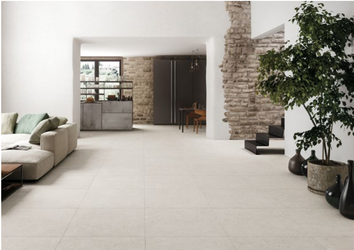
Mold Mist 30 x 30 (special order size)