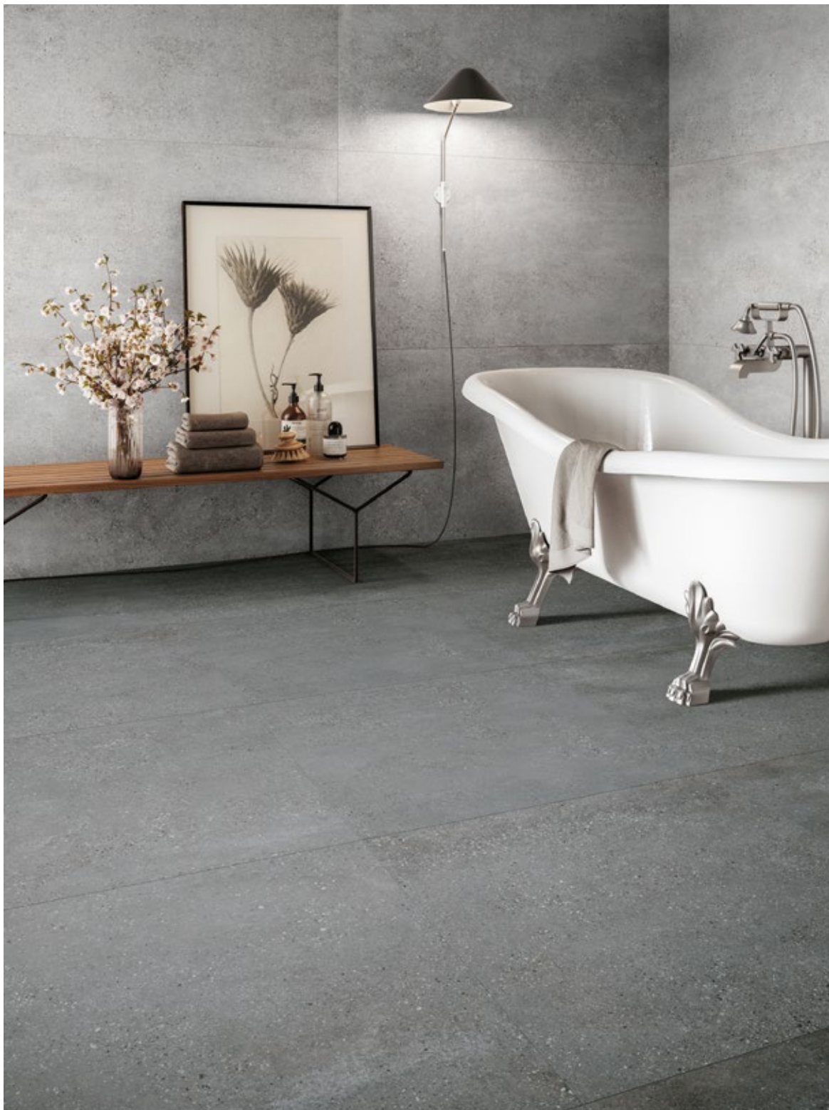
Mold Iron 30 x 60 (special order size)