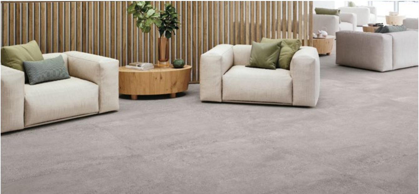
Mold Nickel 48 x 48 (special order size)