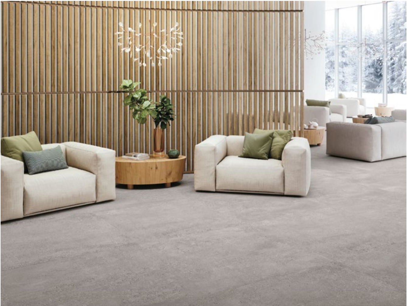
Mold Nickel 48 x 48 (special order size)

prod name Mold 12 x 24 Mold 24 x 48 Mold 30 x 30 Mold 30 x 60 Mold 48 x 48