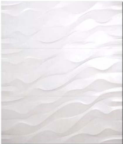
Surface Canvas Elix