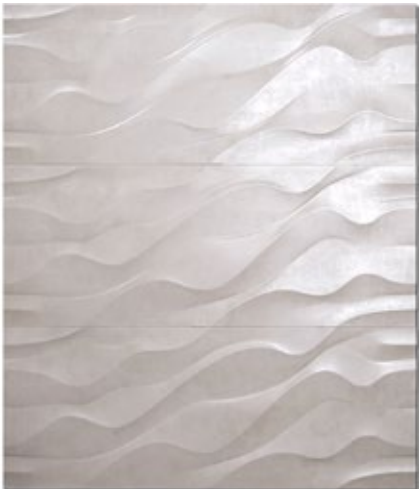
Surface Ash Elix