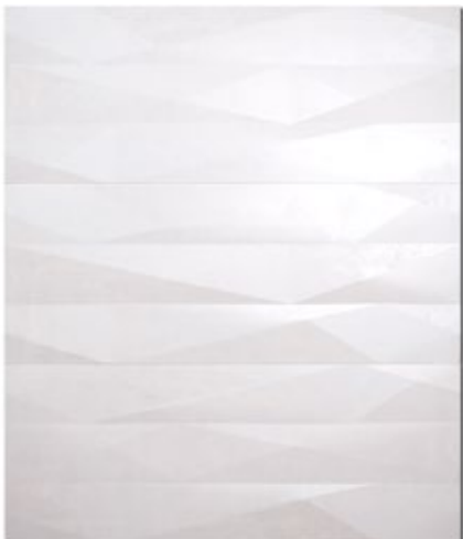
Surface Canvas Unever