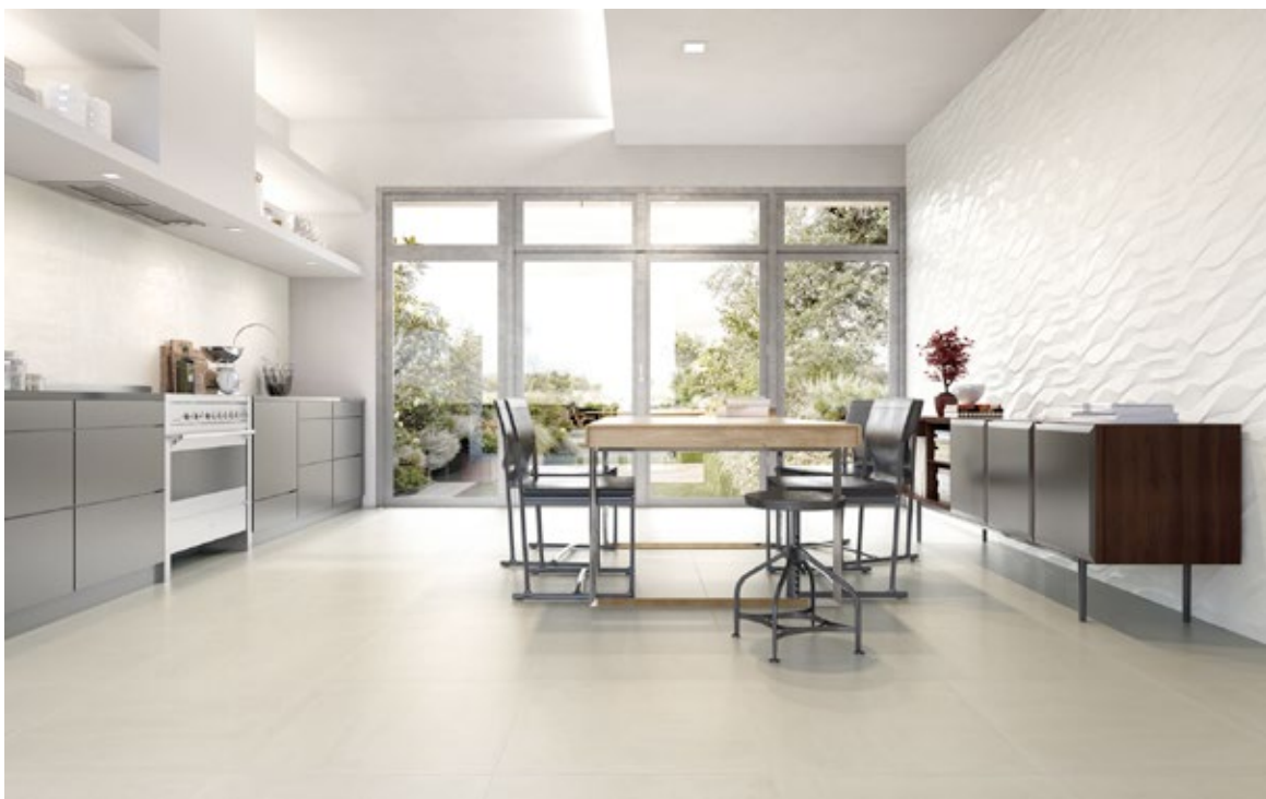
Surface Talc Elix and Syncro White