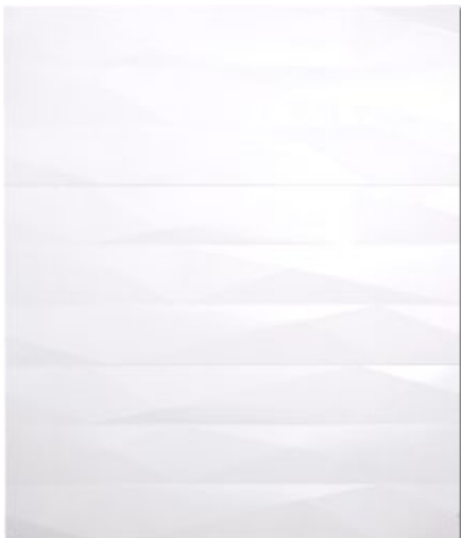
Surface Talc Unever