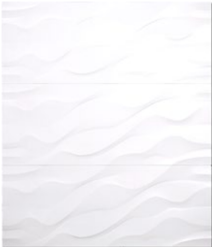
Surface Talc Elix