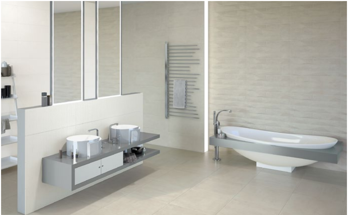
Surface Ash, Surface Talc, Surface Ash Unever and Syncro Grey