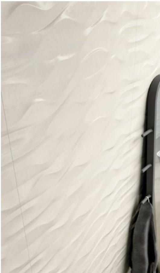
Surface Canvas Elix