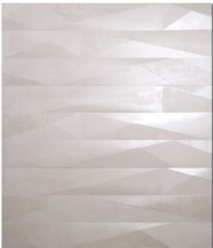
Surface Ash Unever