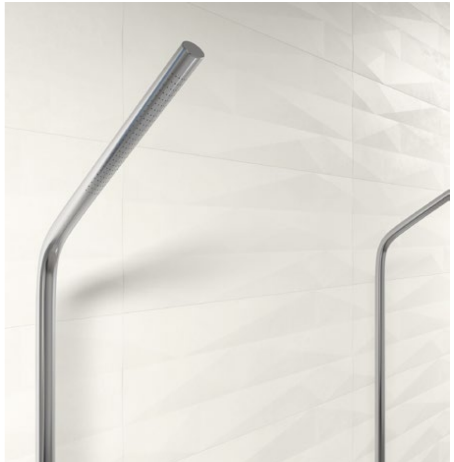
Surface Talc Unever