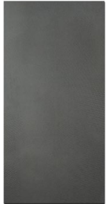
Trax Slate Soft