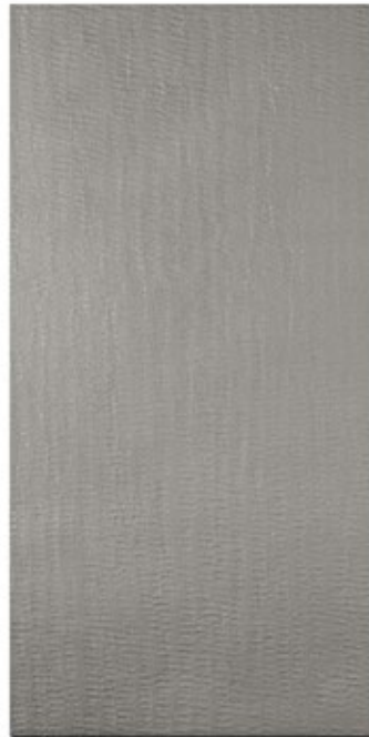
Trax Ash Hard