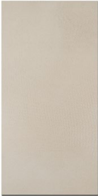
Trax Cotton Soft