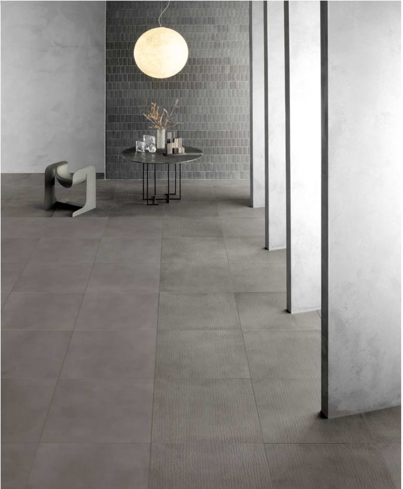
Trax Slate Soft + Slate Hard