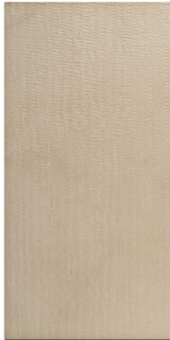
Trax Cotton Soft