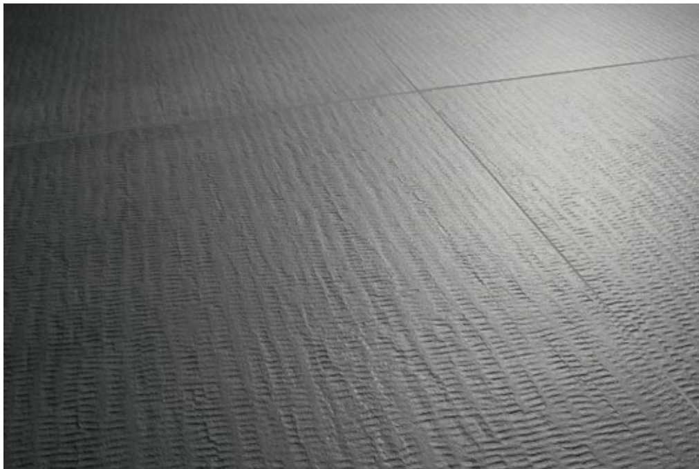
Trax Slate Hard