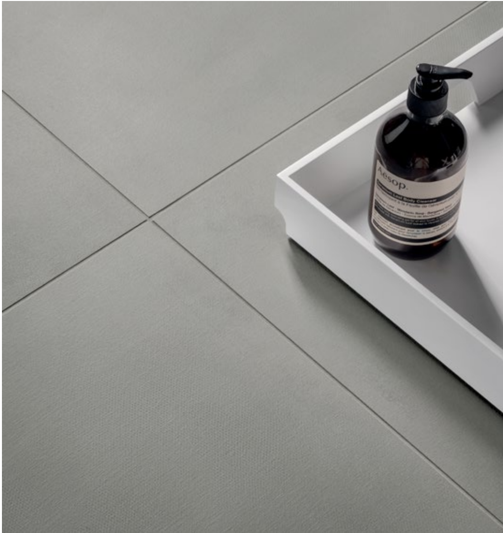
Trax Ash Soft

Colors and Aesthetical features in this catalogue are to be regarded as indications. Please refer to physical samples for clarification.