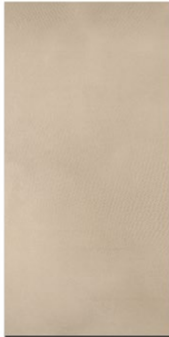
Trax Camel Soft