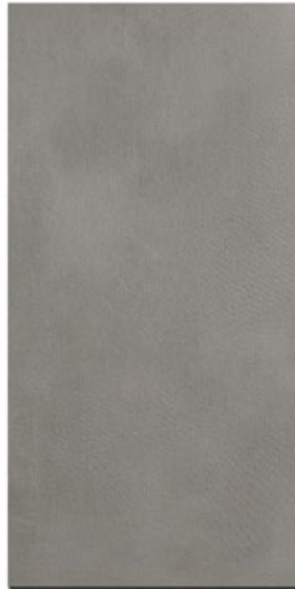
Trax Ash Soft