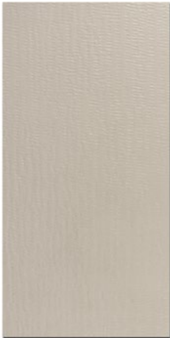
Trax Cotton Hard